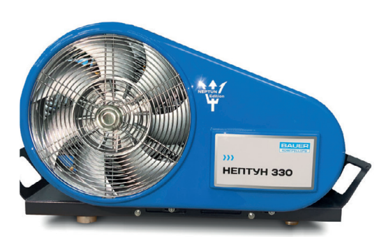
NETPUN - produced locally in BAUER quality

For BAUER KOMPRESSOREN, the biennial NEVA trade show held at St Peters-