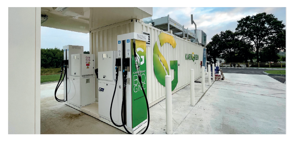
Biogas fuelling station in Ploërmel

The new C26 XXL mobile CNG system from BAUER's US subsidiary, BAUER COMPRESSORS INC. (BCI), is the realization of an exceptionally versatile and flexible concept that is accordingly generating enormous interest in the CNG sector. In early October the second mobile CNG system of this kind was supplied to customer Cleancor LLC for use with its existing CNG stations, expanding fuelling capacity by adding the option of liquid natural gas (LNG) fuelling. The first system is in operation in Palm Springs, California. Here too, the local energy supplier uses the system to make up the supply shortfall from the existing gas pipeline. Once pipeline capacity is expanded, a new stationary BCI C52.12 X-Fill™ system will be placed into operation. Thanks to its mobile design, the existing C26 XXL can then simply be transported to another location to start operations there. Originally designed for pipeline evacuation, the XXL™ CNG system is designed