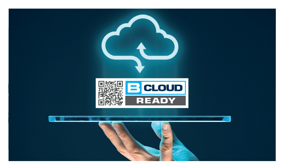
Always in the picture with B-CLOUD

For BAUER customers, the new B-CLOUD platform represents a quantum leap in terms of convenience, safety and security in system operation. All stationary compressor and gas measurement systems with latest-generation B-CONTROL MICRO+net control units can transmit their operating data to B-CLOUD, where customers can access them at any time from a smartphone or computer. Seamless end-toend condition monitoring enables key data including temperature, operating pressure, oil pressure, filter cartridge saturation and gas measurement values to be kept in view at all times, virtually in real time and anywhere in the world, regardless of a system's physical location. Maintenance works such as an upcoming filter cartridge replacement or fault alerts like loss of oil