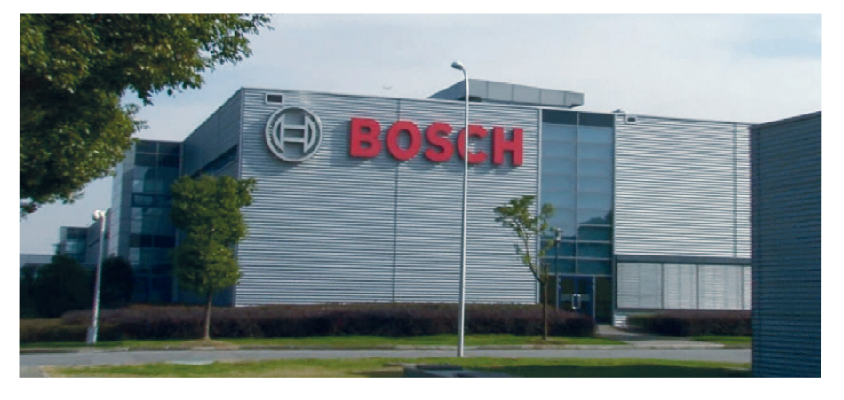
BOSCH branch at Wuxi, China

The Chinese government has recognised the potential offered by natural gas, an environmentally friendly and low-pollutant fuel, in reducing trafficrelated air pollution. Compared with their petrol-driven counterparts, natural gas engines emit 25 per cent less carbon dioxide, 60 per cent less carbon monoxide, and zero particulate. Bosch is a global specialist in fuel injection systems and engine components. The company has developed a test rig for analysing fuel injection systems, with two BAUER CTA 23.2 compressors that provide the highly compressed natural gas required for the test procedures. These high-performance water-cooled systems can compress 140 cubic metres