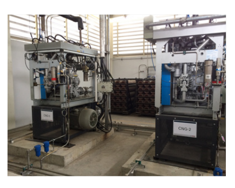
Supplying gas to an engine test rig

One of the most urgent problems facing China today is air pollution, which has increased dramatically as traffic volumes have exploded. Surging levels of industrial production have caused the volumes of goods transported by road to soar; in addition, many members of today's growing middle classes can now afford to own and run a car. The dimensions of this pollution problem become clear when we take a look at the numbers of cars sold – at almost 25 million, compared to 3.2 million in car-friendly Germany. In addition, China is vast, and travel distances within the country are