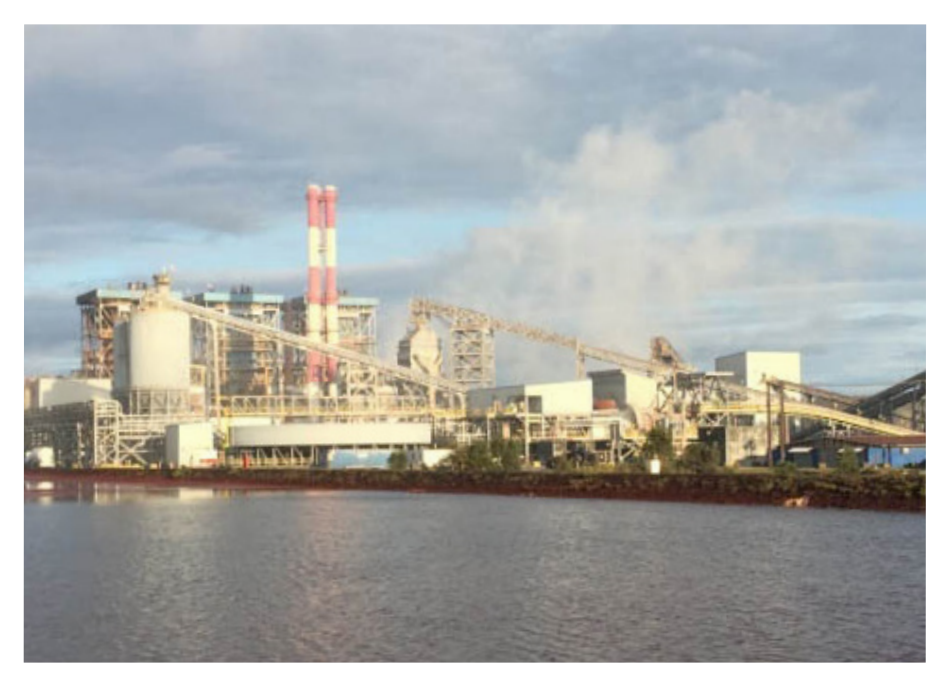
The refinery, 11 kilometres south of the port of Toamasina

One of the world's largest nickel and cobalt mining areas is located near Toamasina in the north-east of the island of Madagascar. The ore reserves in the region are estimated at 125 million tonnes.