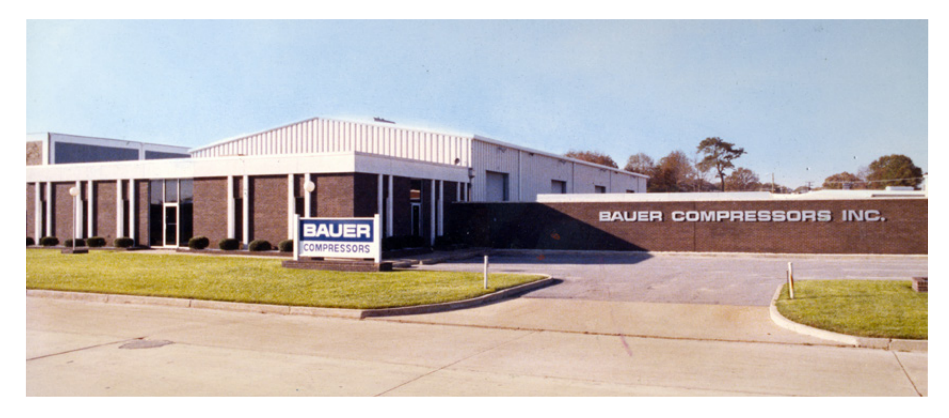
BAUER COMPRESSORS in Norfolk, Virginia