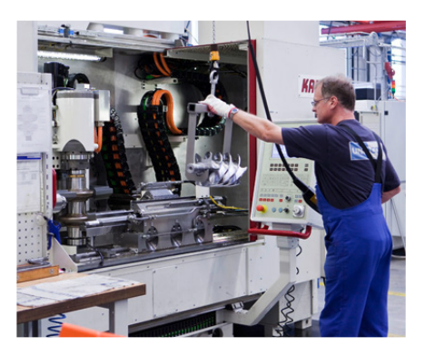
Setup of a CNC machine tool

Closely related factors include the establishment and communication of a clear vision for UNICCOMP and a restructuring of its operations from functional organisation to process-based organisation, accompanied by clear overall process responsibilities.