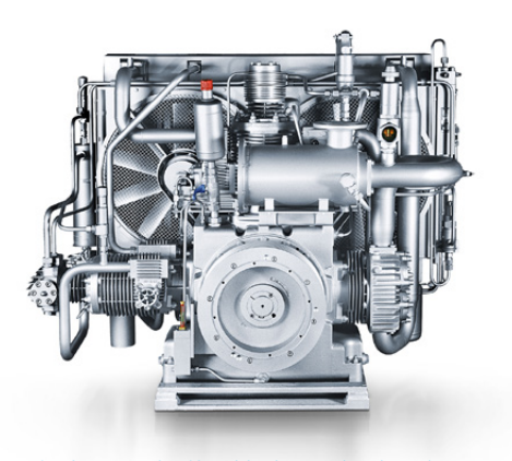
In the 80s, the K25 block was developed to mar ket-readiness in record time.

product range did not contain any compressor block models that were capable of delivering the required volume of compressed air; the K25 blocks that were planned for use in the systems were still only an idea in the research and development department. However, they were perfected as market-ready products within a recordbreaking time of only six months.