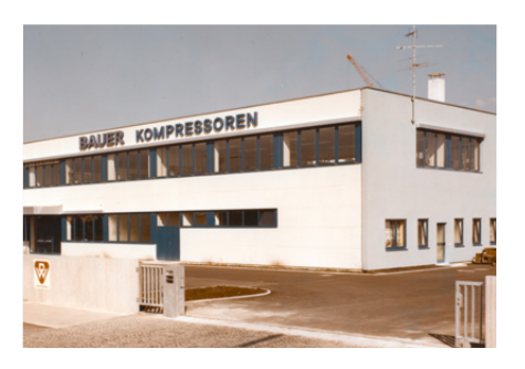
1978: The new BAUER KOMPRESSOREN plant in Drygalski Allee, München

With this in mind, from the mid-1970s he resolutely embarked on a targeted course of expansion. The foundation of BAUER COMPRESSORS in Norfolk, Virginia, USA, marked the start of the company's entry into international markets. The location of the new company, near the country's biggest